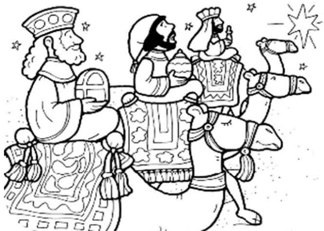
The star they had seen rose and went ahead of them until it stopped over where the child had been born.

Say a prayer together telling God how Jesus brings peace and calm to your family. Color in the candle of Peace and open the envelopes on your Advent calendar.