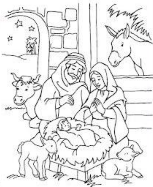
She wrapped him in cloths and laid him in a manger, because there was no room for them in the inn.